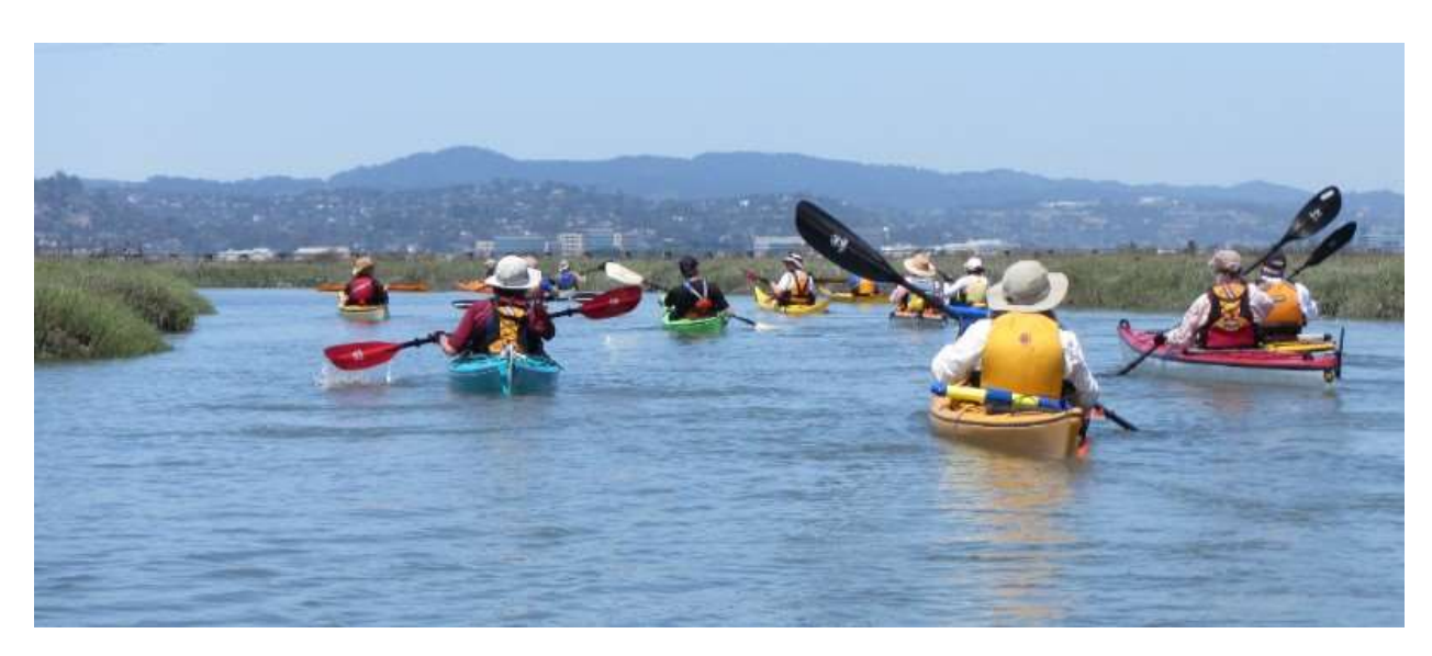
https://commons.wikimedia.org/wiki/File:Kayakers in Redwood City, California.jpg